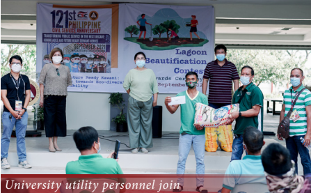
University utility personnel join lagoon beautification contest Page 2