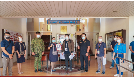
DILG Tarlac awards Safety Seal to TSU Page 3